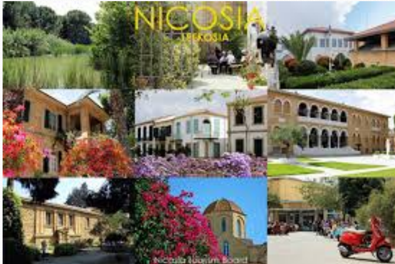
1) Nicosia (Lefkosia)